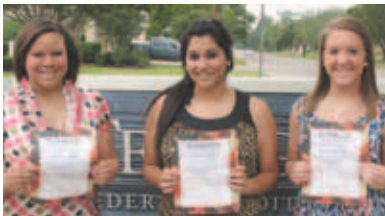
2011 Texasgulf FCU Scholarship Recipients

This will be the 5th year that Texasgulf FCU is offering a scholarship program to credit union members and the children of credit union members. Three scholarships of $1000 each will be awarded. They will be disbursed as $500 for the fall semester and $500 for the spring semester.